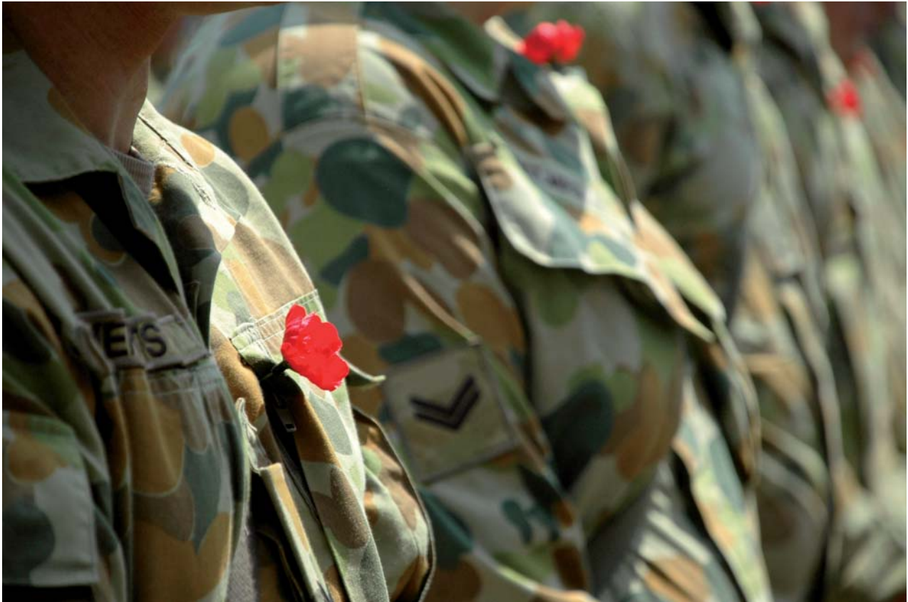
Remembrance Day in Dili, Craftsman Stephen Cunningham.